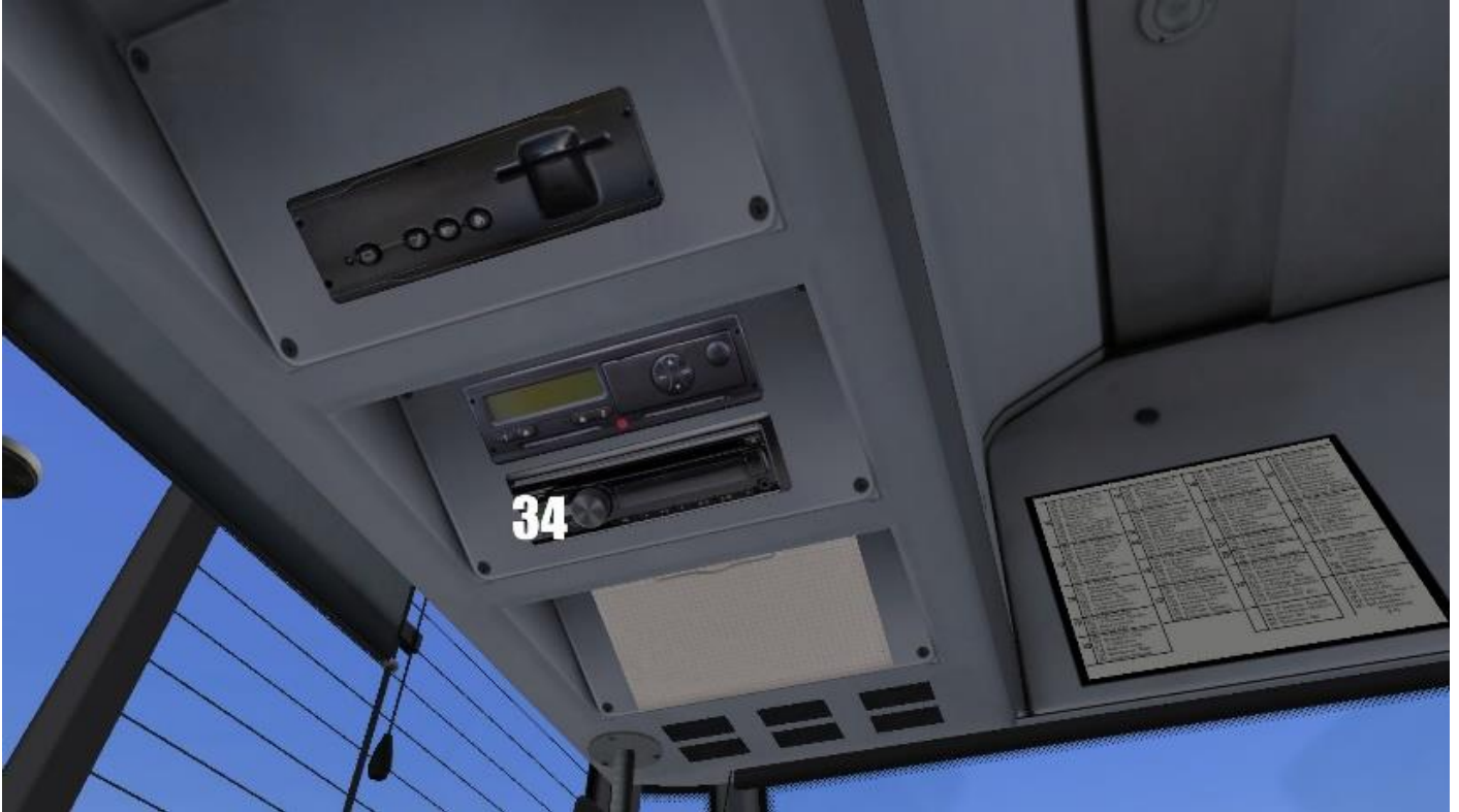
34. Radio on/off