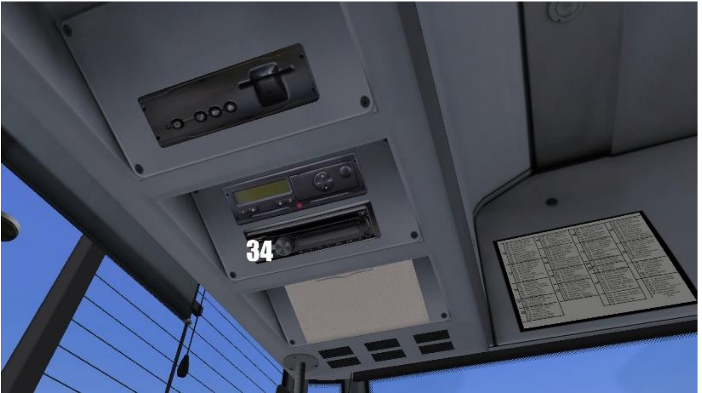
34. Radio on/off